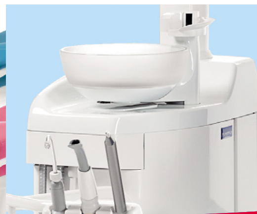
Bowl assembly, clear sandblast