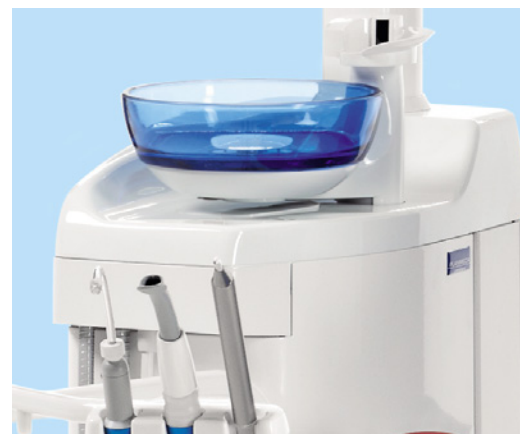
Bowl assembly, blue

The dental unit bowl is subjected to frequent use in treatment situations. As it is heavily exposed to fluids and is one of the most visible parts of the unit, it is recommended to change the bowl assembly at times. With a different colour you can also provide your dental unit with a new look.